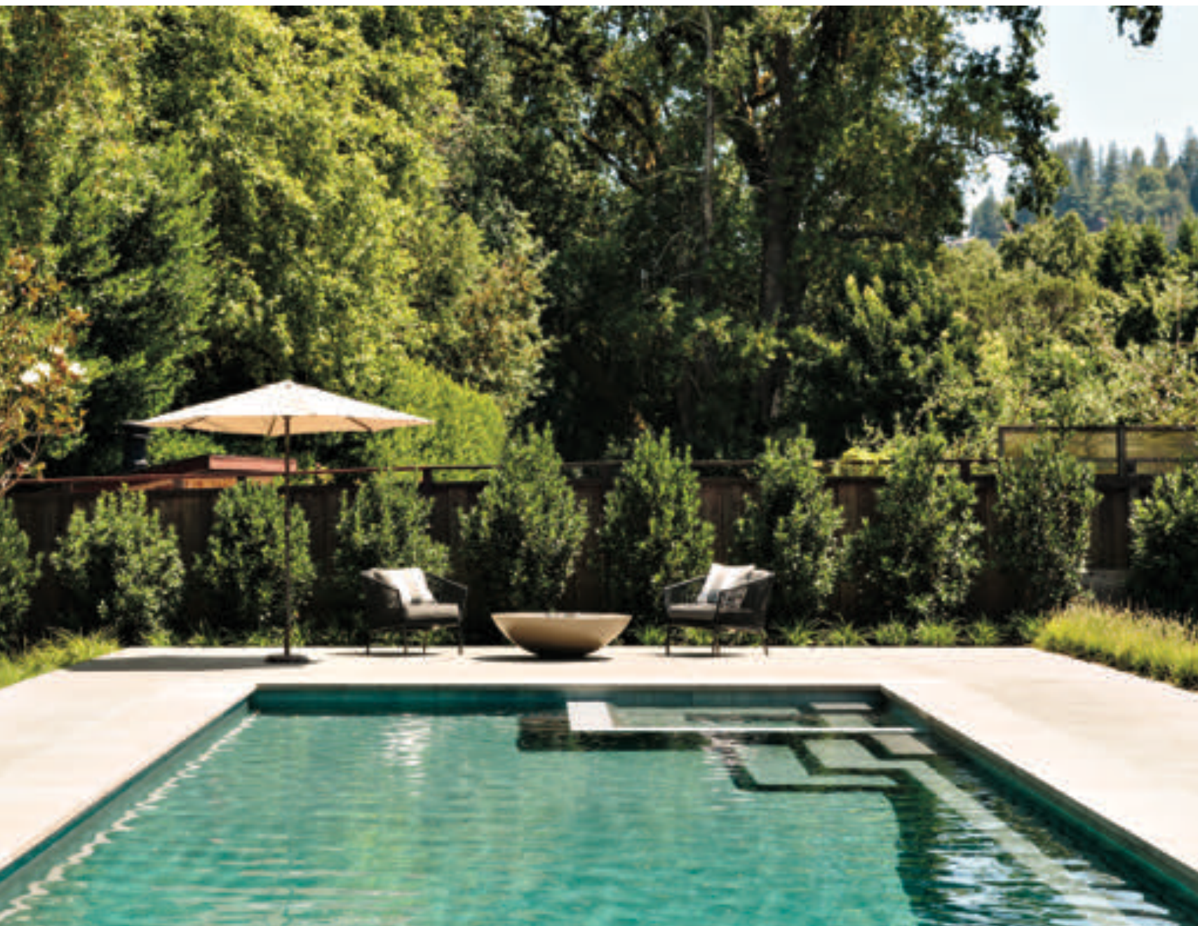
Above: At the far end of the pool deck are a pair of Ronan & Erwan Bouroullec chairs from their Palissade Collection for Hay.