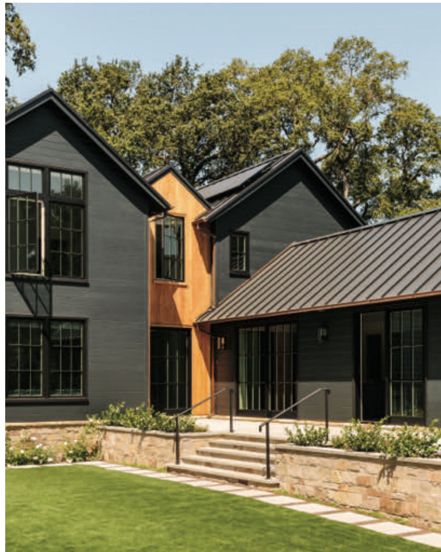
Opposite: The rear terrace steps down to a lawn where the children can play, highlighting the way the hardscape and plantings define the garden's different purposes. The exterior's siding is a contrasting play of custom-stained cedar and Farrow & Ball's Off Black.